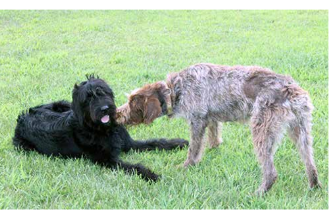
DOVEKIE AND HENRY: WIRE-HAIRED POINTING GRIFFONS

6. Play the radio story, The Case of the Mystery Puppy Solved! (Sort Of). The story can be found at the link below. Tell students that they should be prepared to discuss the following questions after listening to the story. Alternatively, you may download and print the transcript and have student read the story.