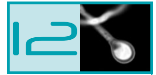
Pseudallescheria boydii fungus.

Students will share what they have learned over the course of the unit by revisiting their concept maps, presenting them to the class, and completing the same assessment they received at the beginning of the unit (see Answer Key, sidebar, p. 1).