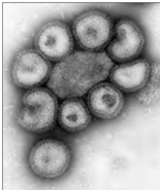
This transmission electron microscope image shows several influenza virus particles.